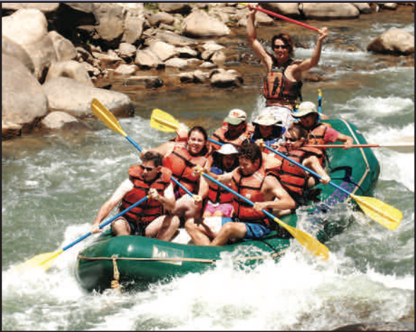
Rafting the Animas River from Reunion 2010

We know you are out there itching to come to camp because we hear a request for adult camp or family camp at every slideshow and campfire. Well it's time to put your mountain where your mouth is and make the journey to CSC. Alert the press! This is your chance to de-stress, regress, make a mess, worry less, reassess, your kids impress, your “yawp!” profess, your family bless, no fancy dress, fun to excess, mountain sun your face caress, your youthful joy to repossess. Don't obsess, desire suppress, and/or distress. Just say yes! Take recess! Schedule, finesse! Find egress by express to this address in the wilderness! We must