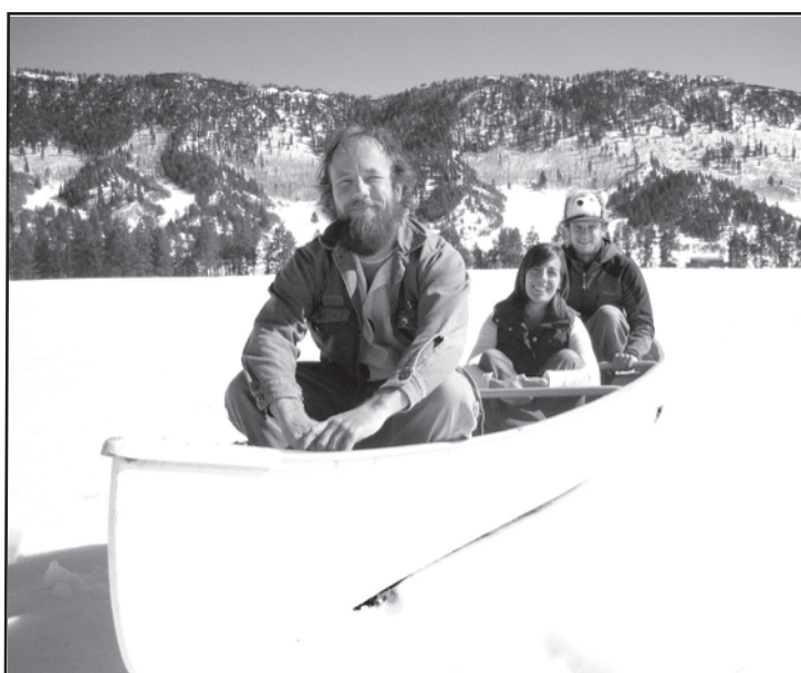
Afloat on an expanse of snow.